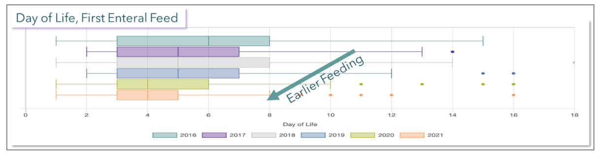
Figure 1: Day of life for first enteral feed, results show earlier first feeds per new protocol.